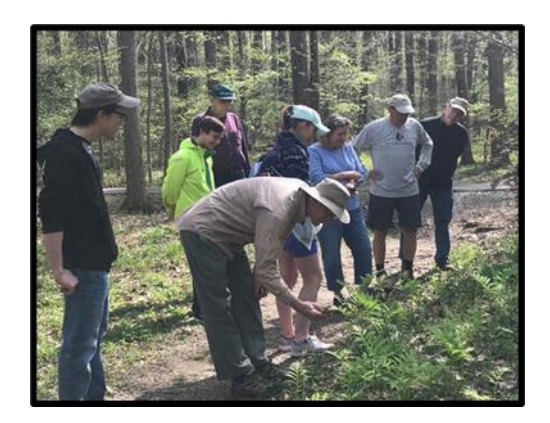
WORSHIP Prayer and nature walks to learn about and appreciate God's creation