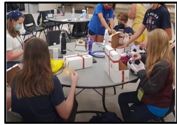
FORMATION Rooted program encourages seeing the connections between the active and spiritual life