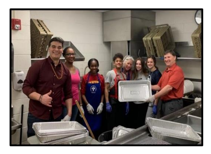
STEWARDSHIP Mardi Gras dishwashing reduces single use plastics and paper product waste