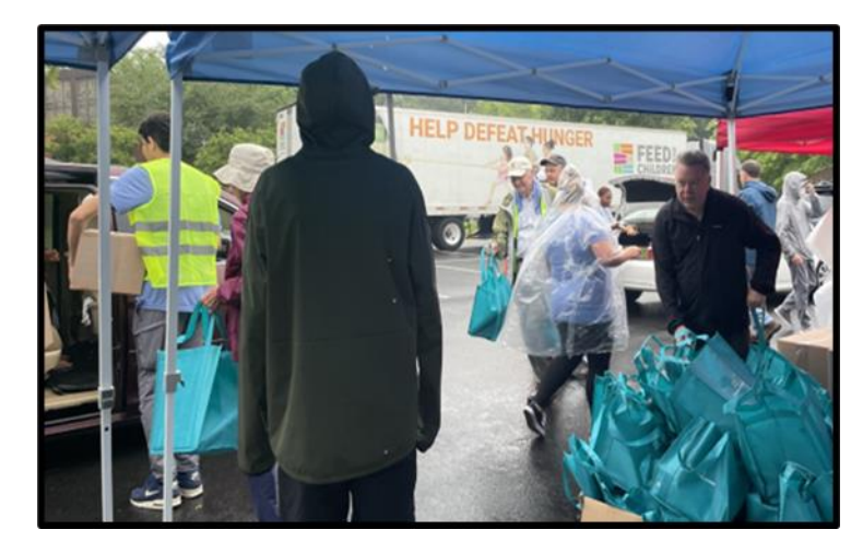
COMMUNITY SJN coordinated with Starkist Tuna and the Feed the Children Program to prepare summer relief packages